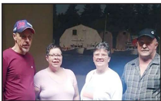
HEARTFELT BLUEGRASS (PEI)