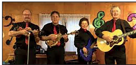
BLUE ZONE (PEI)