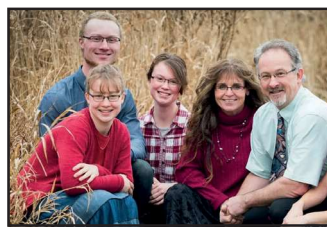
THE STIFF FAMILY (PEI)