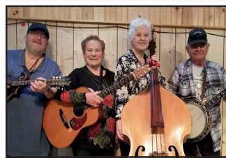
SK BLUEGRASS (PEI)