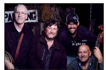
BLUEGRASS DIAMONDS (NB)