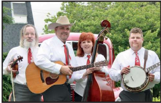
BLUEGRASS TRADITION (NS)