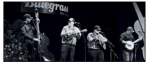
HIGH RIVER (NB)