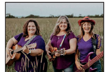
TREBLE MAKERS (PEI)

ADMISSION for each event: $10, FREE with Festival Bracelet